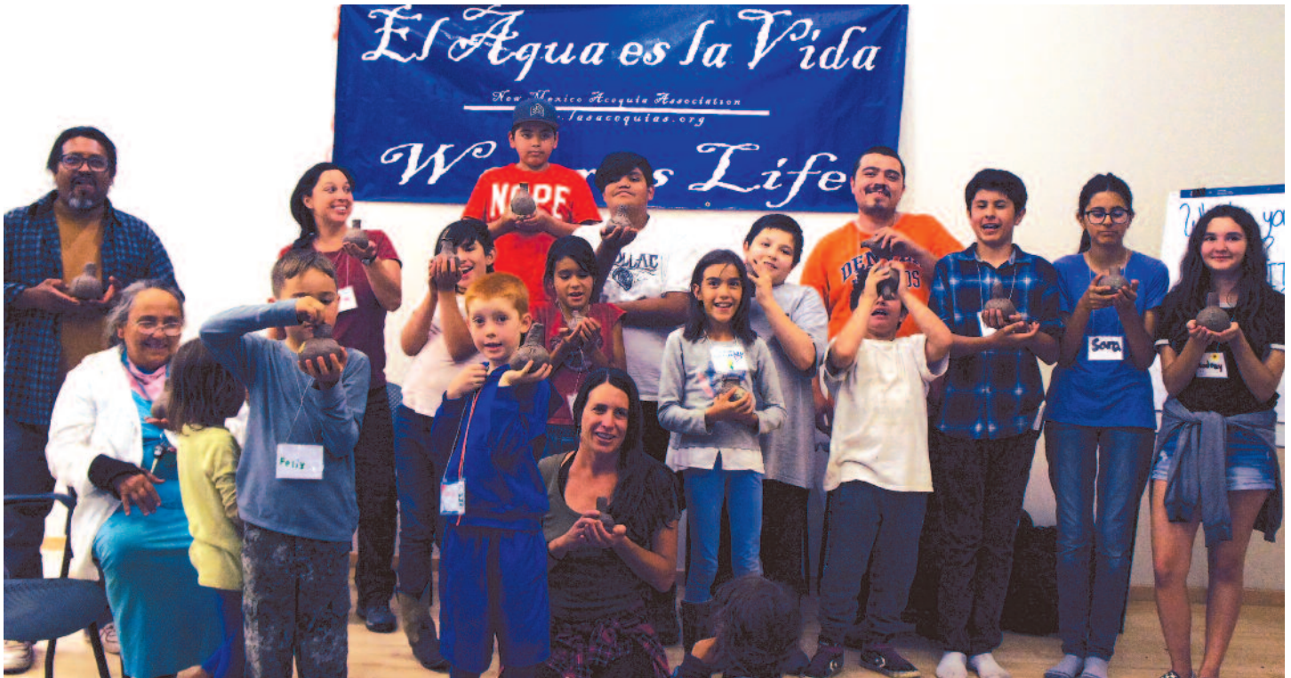
Sembrando Semillas summer camp participants.