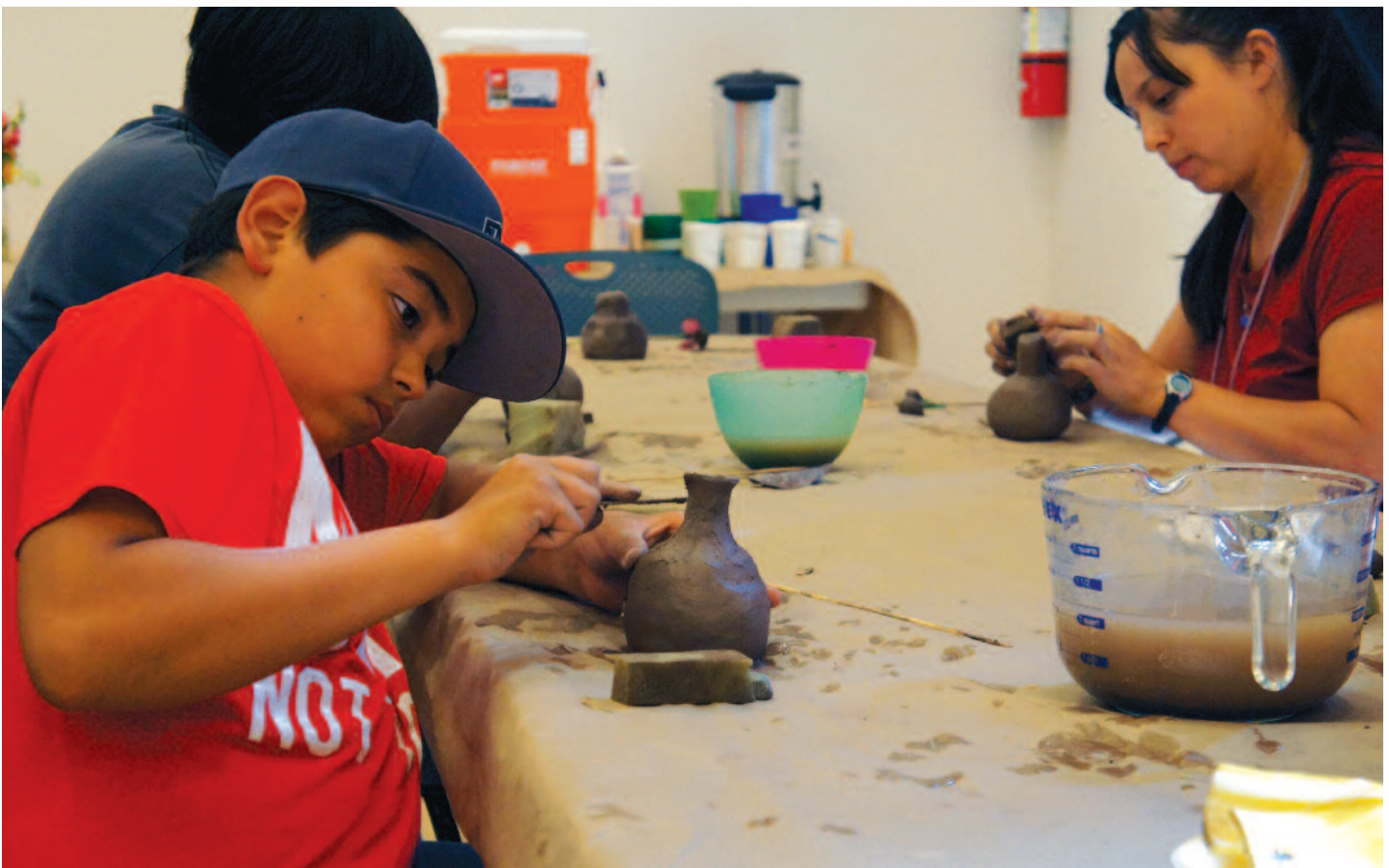
Youth work on their clay seed pots at summer camp.

Thank you to all of the teachers, mentors, volunteers, parents, and youth who participated in summer camp 2019—including the inspiring young leaders from the Northern Youth Project (NYP) who also joined our Sembrando Semillas cohort! 💧