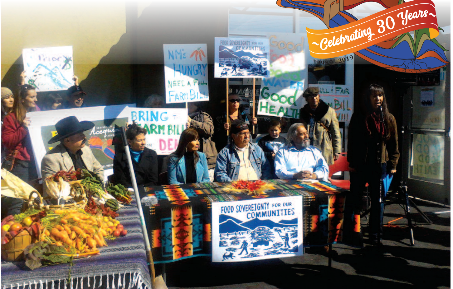
In 2013 NMAA hosted a rally to encourage the passage of a new Farm Bill.