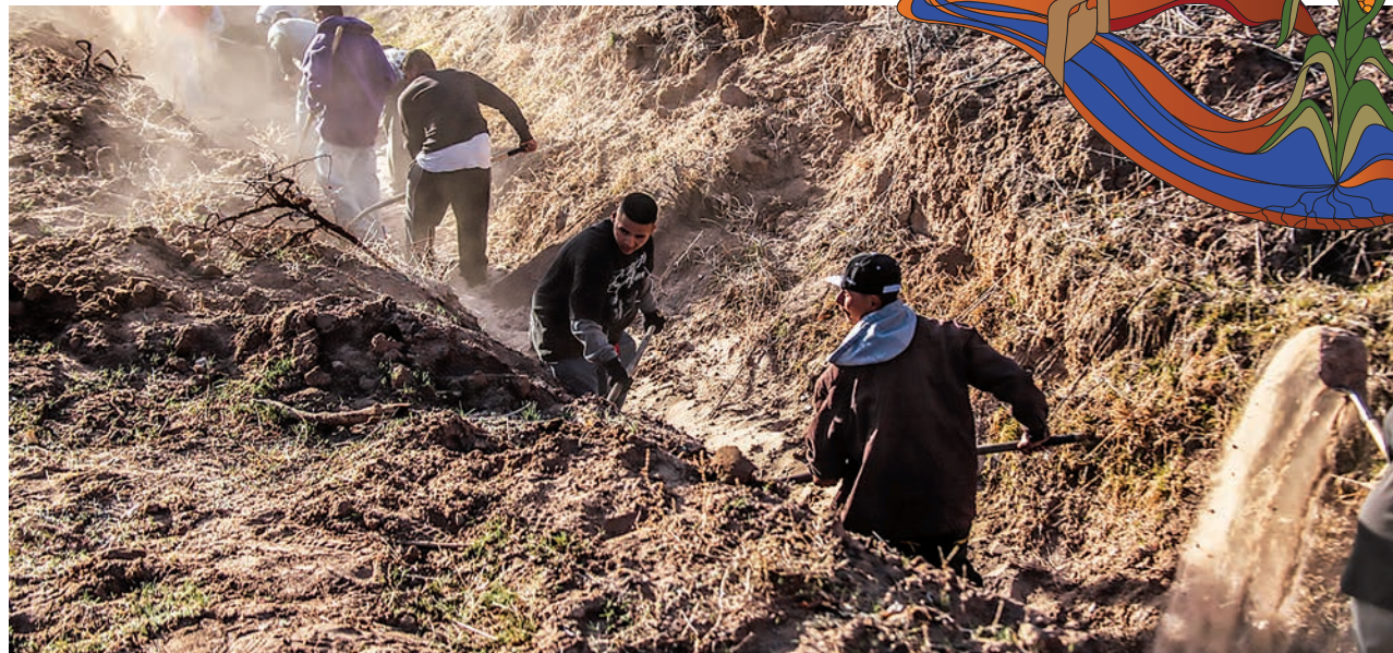
Peones (workers) have gathered for generations to sacar their acequias in the spring to remove silt and debris so that water can flow. Even as snowpack and runoff are more uncertain, this spring ritual continues every year.