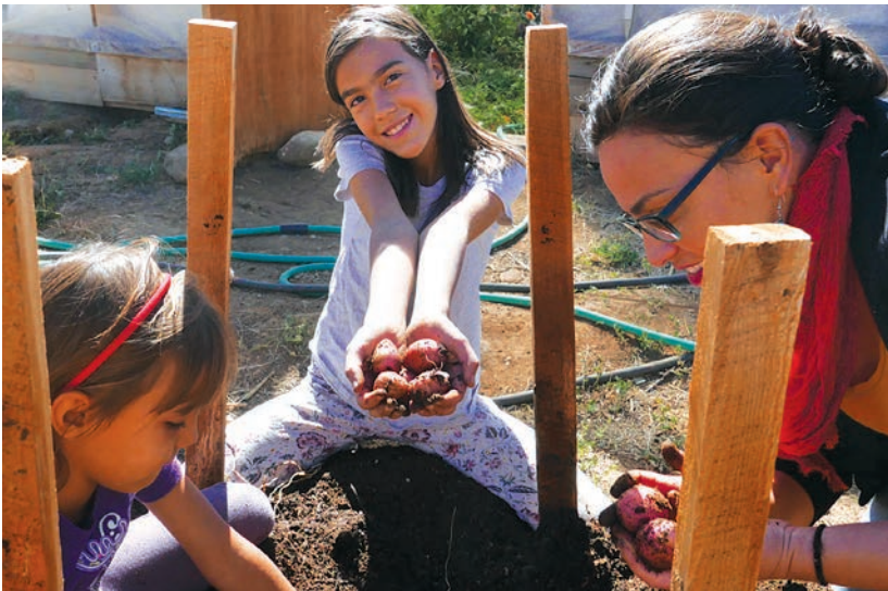
Sem Sem youth in Taos experiment with different methods for growing potatoes.