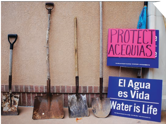
Palas and signs to “Protect Acequias” on display at the NM State Capitol.

Though NMAA is pleased that several of our proposed friendly amendments were incorporated into the final rules, we remain vigilant regarding the application of these rules, particularly with regard to a new variance rule allowing cannabis producer license applicants and licensees to request non-compliance with an RLD/CCD regulation. NMAA’s advocacy, along with the support of numerous parcientes who provided public comments, was able to secure parameters for when a variance may be granted. Variances may not be granted if they would be contrary to requirements of the CRA (such as the requirement that cannabis producer license applicants submit proof that they have access to a legally valid source of water), or if they would have a negative environmental impact (such as im-