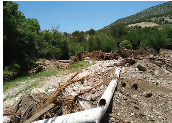
Flood damage to the Antonio Sanchez Ditch, which included a damaged section of pipeline which conveyed water to numerous landowners.

We headed out from the office in a caravan following Powell. It is important to note the importance of Powell's position as a liaison between the acequias and the state agencies. Without her vast local knowledge of the watershed, it would have been very difficult to know where the flood damage is located, "you wouldn't be able to see the damage from the road and they [agency officials] would not know where to go."