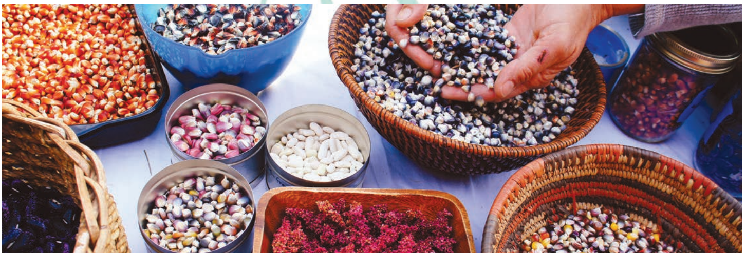
Beautiful and strong local seeds.

We also know that these important seeds help restore the strength of our hearts during hard times. When we close our eyes and hold a smooth bean or a heart-shaped kernel of corn in our hands, we feel the protection of those that have come before us, and we feel like we have some power to help make a good life for our children and grandchildren. So long as we keep caring for the seeds, they will care for us. We need each other now more than ever. 💧