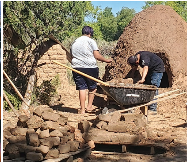
Sem Sem youth in Abiquiu work together to build a horno.