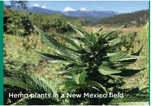
Hemp plants in a New Mexico field