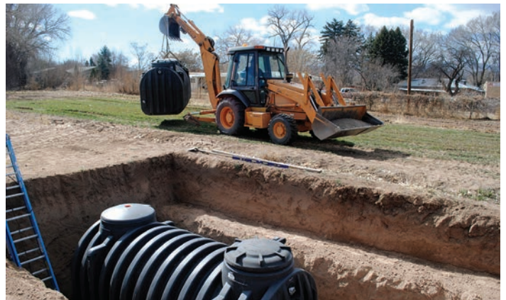
Acequia-fed water cisterns feed drip irrigation.

NMAA is committed to supporting acequia agriculturalists in finding their way through these difficult times, and the many challenges such as intense winds, late frosts, water shortages, flooding events, high temps and the threat of wildfires. One of the ways we can do this is by helping you access Natural Resource Conservation Service (NRCS) programs including “Conservation Incentives” that help producers implement soil and water conservation methods on their farms! NRCS offers technical assistance, as well as access to funding to help off-set