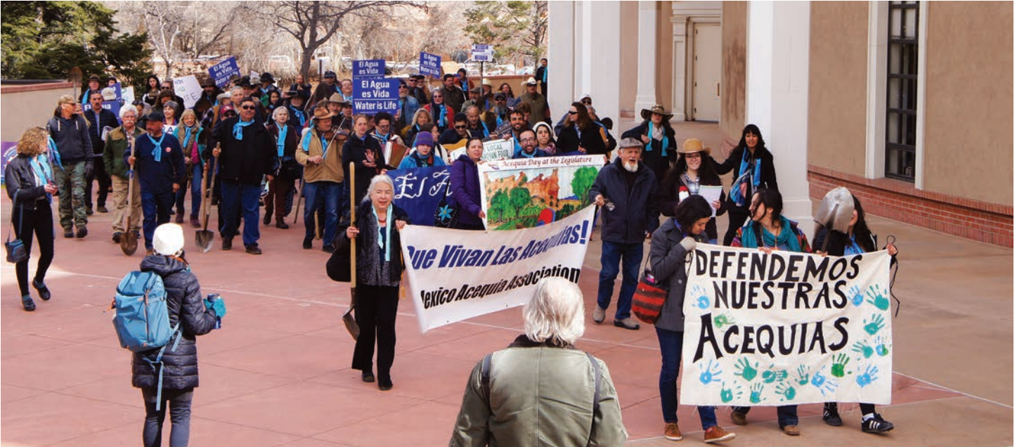
Acequia community members in action at Acequia Day at the NM State Legislature, January 2020.