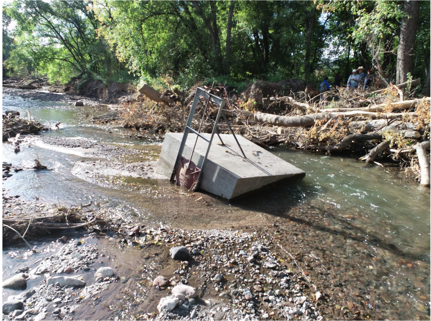
Above: Flooding from the Black Fire and impacts to the Grijalva Ditch Diversion in Grant County

Debris flows, ash, and sediment can clog acequia waterways and can deposit on farmlands.